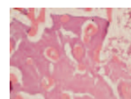
histology after 14 weeks

Studies have demonstrated that the treatment with an Er:YAG laser has a bactericidal effect. 8 Er:YAG laser treatment can debride the implant surface effectively and safely without damaging. 31,35 Much better clinical results have been reported for Er:YAG laser treatment compared with non-surgical mechanical debridement. 15,27,31,35