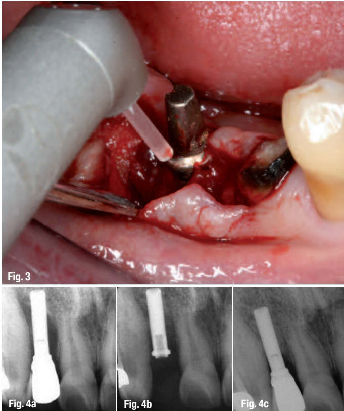
Fig. 3 Removal of plaque biofilm and granulation tissue using the LiteTouch Er:YAG laser with its 1.3 x 1.4 mm sapphire tip.